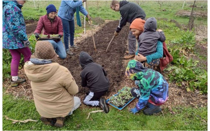
Above: Intergenerational, ecumenical Spring Planting Party at Acres of Abundant Grace for our September 23 noon "Climate Café Kids' Kitchen" Pop-up Meal.

Come taste and see the grace-filled goodness of being and sharing together!!