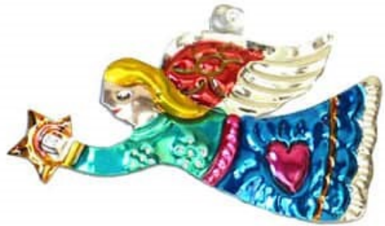
Hand-made tin Christmas Angel made in Oaxaca, Mexico

When you give blood you will receive a $10 gift card from Amazon.